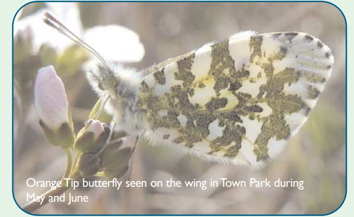
Orange Tip butterfly seen on the wing in Town Park during May and June

In May, a habitat survey highlighted some of the main areas of wildlife interest, including grassland with wildflowers such as the northern marsh orchid, important trees for species such as bats, and other, rarer, wildflowers. Most of the proposed area of works will avoid these sites - instead improving habitats of a poor quality with little wildlife interest. Where there are interesting areas that will be affected, this may give us the opportunity to create something new.